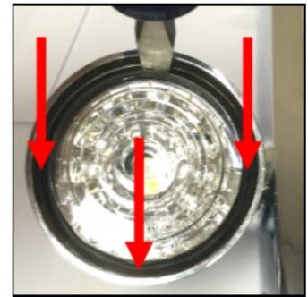
Gently pry around the perimeter