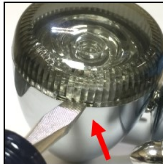
Remove Lens at the slot

Note: 2013 & Earlier Sportsters®, 2011 & Earlier Dynas®, 2010 & Earlier Softails®, 2013 & Earlier H-D™ Touring and H-D™ Trikes and all V-Rod® Models require a SMART Signal Stabilizer™ or Load Equalizer to ensure proper function and flash speed of LED Turn Signals.