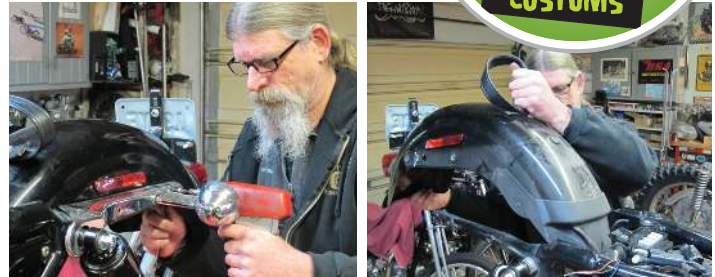
"Lose Those Stock Parts..."