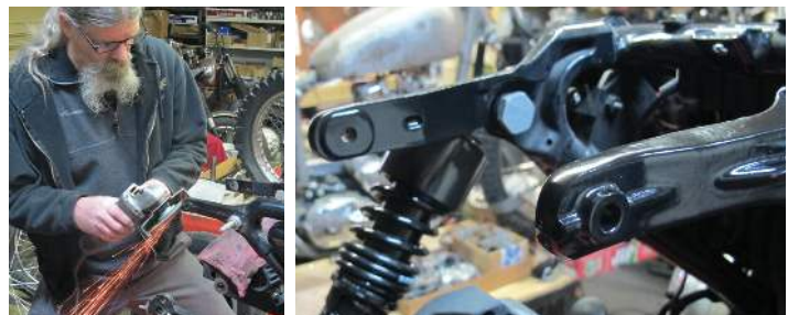
"Time To Clean Her Up!"