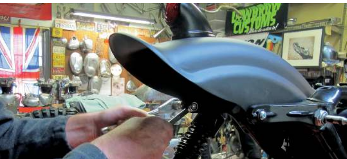
"Easy, Peezey... We're Almost There..."