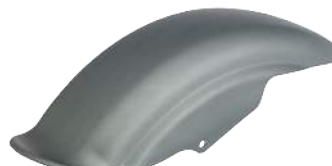
SILVER ANODIZED - SKU: 003640