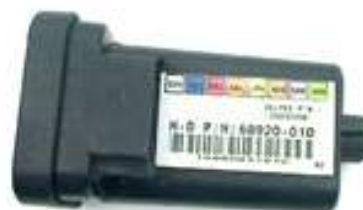
OEM 68920-01D 68922-00D