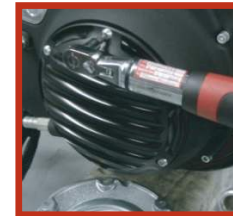
FIG B TORQUE SEQUENCE