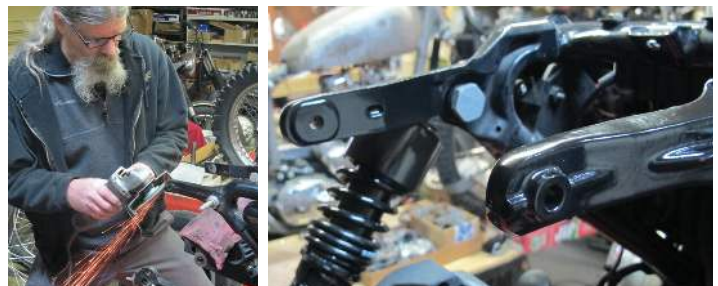
"Time To Clean Her Up!"